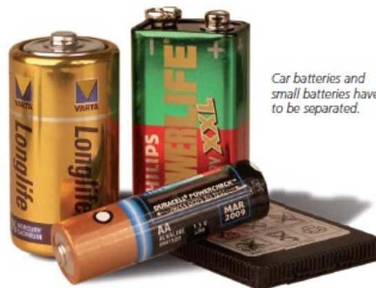
Car batteries and small batteries have to be separated.

Engine sludge (2) <50 m 3 /h Tank wash water (3) <150 m 3 /h